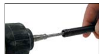
Special hex adapter on the bit allows the Titen Installation Tool to slide over the bit and lock in, ready to drive screws.