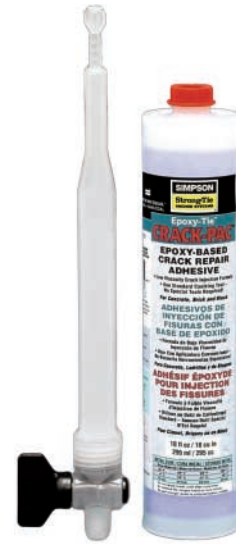
Crack-Pac® Injection Epoxy (ETIPAC10)

Very good to excellent against distilled water, inorganic acids and alkalis. Fair to good against organic acids and alkalis, and many organic solvents. Poor against ketones.