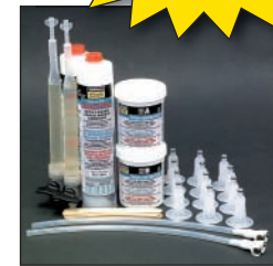
Crack-Pac® Kit Components

Crack-Pac® injection epoxy is also available in the Crack-Pac Injection Kit. The kit includes everything needed to pressure inject approximately 8 lineal feet of cracks: