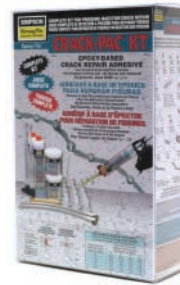
Crack-Pac® Kit (ETIPAC10KT)