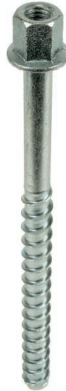
Titen HD® Rod Coupler U.S. Patent 5,674,035 & 6,623,228