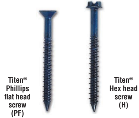
Titen® Phillips flat head screw (PF)

Preservative-treated wood applications: Suitable for use in non-ammonia formulations of CCA, ACQ-C, ACQ-D, CA-B, SBX/DOT and zinc borate. Use in dry, interior environments only. Use caution not to damage ceramic barrier coating during installation. Recommendations are based on testing and experience at time of publication and may change. Simpson Strong-Tie cannot provide estimates on service life of screws. Contact Simpson Strong-Tie for additional information.