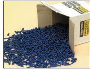
Bulk packaging available for large-volume applications