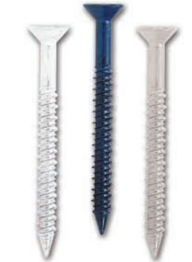
Titen® Phillips head screw available in white, standard blue and silver