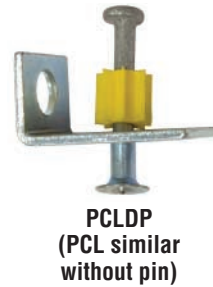
PCLDP (PCL similar without pin)

See pages 207 and 209 for load value information.